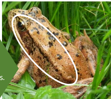
Skin ridges down back