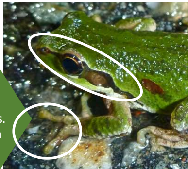
Toepads and eye mask