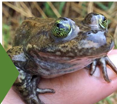
Eyes facing upwards