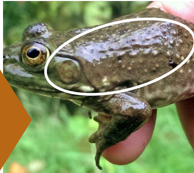
Ear drum & no skin ridges