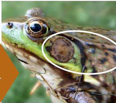
Ear drum & skin ridges