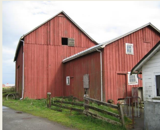
Tall old barn with multiple openings is the ideal nest site location for a Barn Owl pair.

Barn Owls are known to nest in old wooden barns and tree cavities. However, they will easily take to nest boxes placed on poles and boxes installed in or mounted on modern barns.