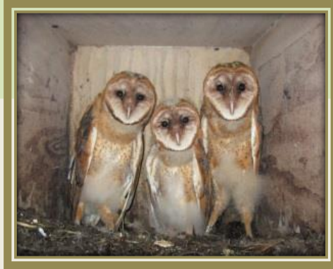
3 owlets soon ready to leave the nest. The owlets will start to learn how to fly when they are around 60 days old.