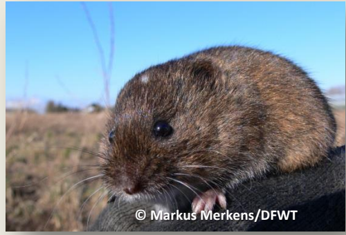
Field voles are the favourite food of the Barn Owl.