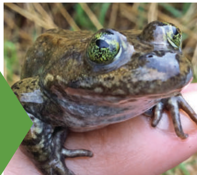
Eyes facing upwards