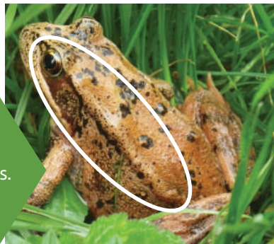
Skin ridges down back