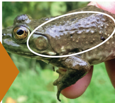
Ear drum & no skin ridges