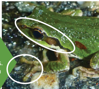
Toepads and eye mask