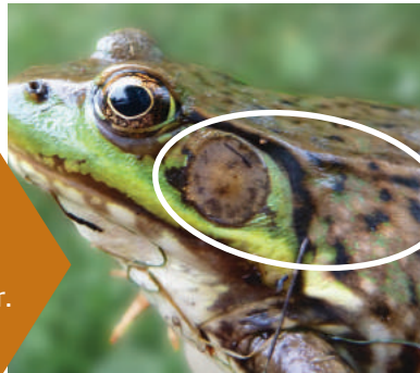
Ear drum & skin ridges