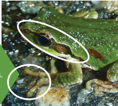
Toepads and eye mask