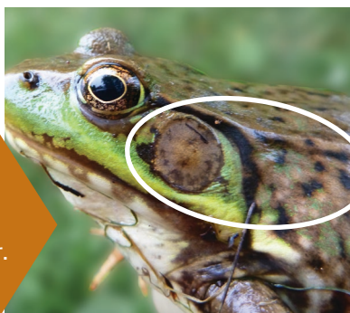
Ear drum & skin ridges