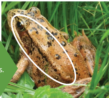
Skin ridges down back