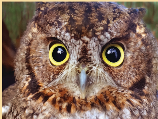
Well camouflaged with small ear tufts.