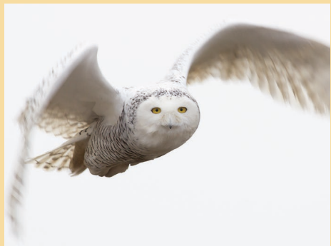
Immature male, or female. Male Snowy Owls become fully white with age.