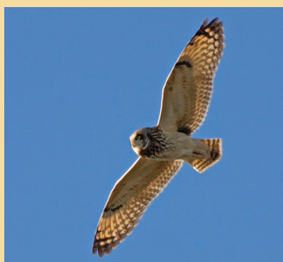
Flaps with stiff beats, making their flight buoyant like a butterfly.