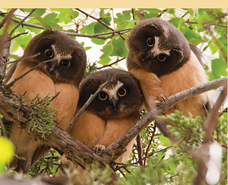
Note the different plumage of the juvenile Saw-whet Owls.